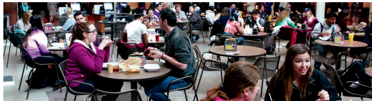
Damen Student Center