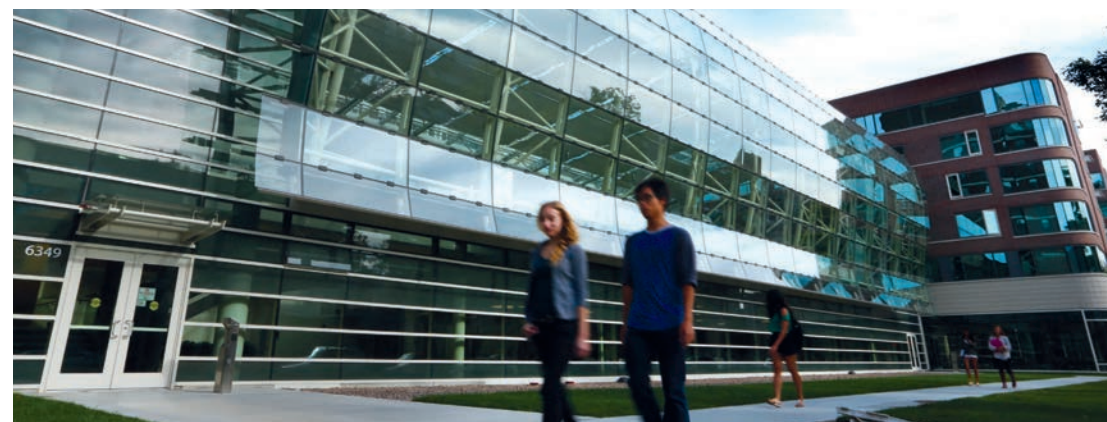
San Francisco Hall