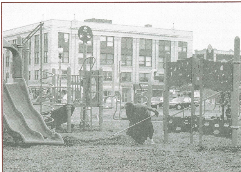
The near-completed playground adjacent to Gale School in Rogers Park.

(ONE), who discussed his experience as an organizer and some of the issues that ONE handles. These speakers have added a dimension to the program that students may not get from only working in the community. The speakers add a face to the activists and a chance to see